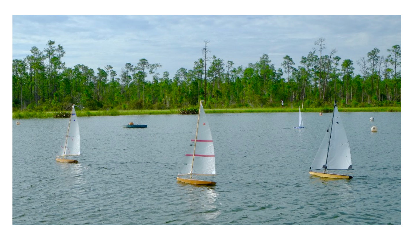
Fall of of 1972 the fleet size was up to the 20 boat goal and the first Class Championship Regatta was held. The current edition of the AMYA Model Yachting magazine lists 139 Star 45 registered boats.

If you really like the Star 45 you can buy a fiberglass hull from Chesapeake Performance Models (CPM) or even a fully completed boat set up the same as the current class champion. Hull Electronics: Internal RMG Smartwinch, Hitec jib trim and rudder servo. Be ready though to write a check for $2,700.00.